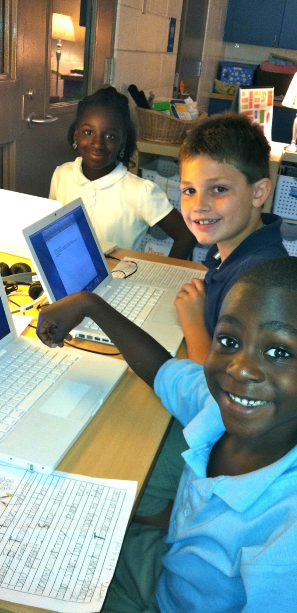
Students work on Macintosh laptops during Computer Technology Studies.