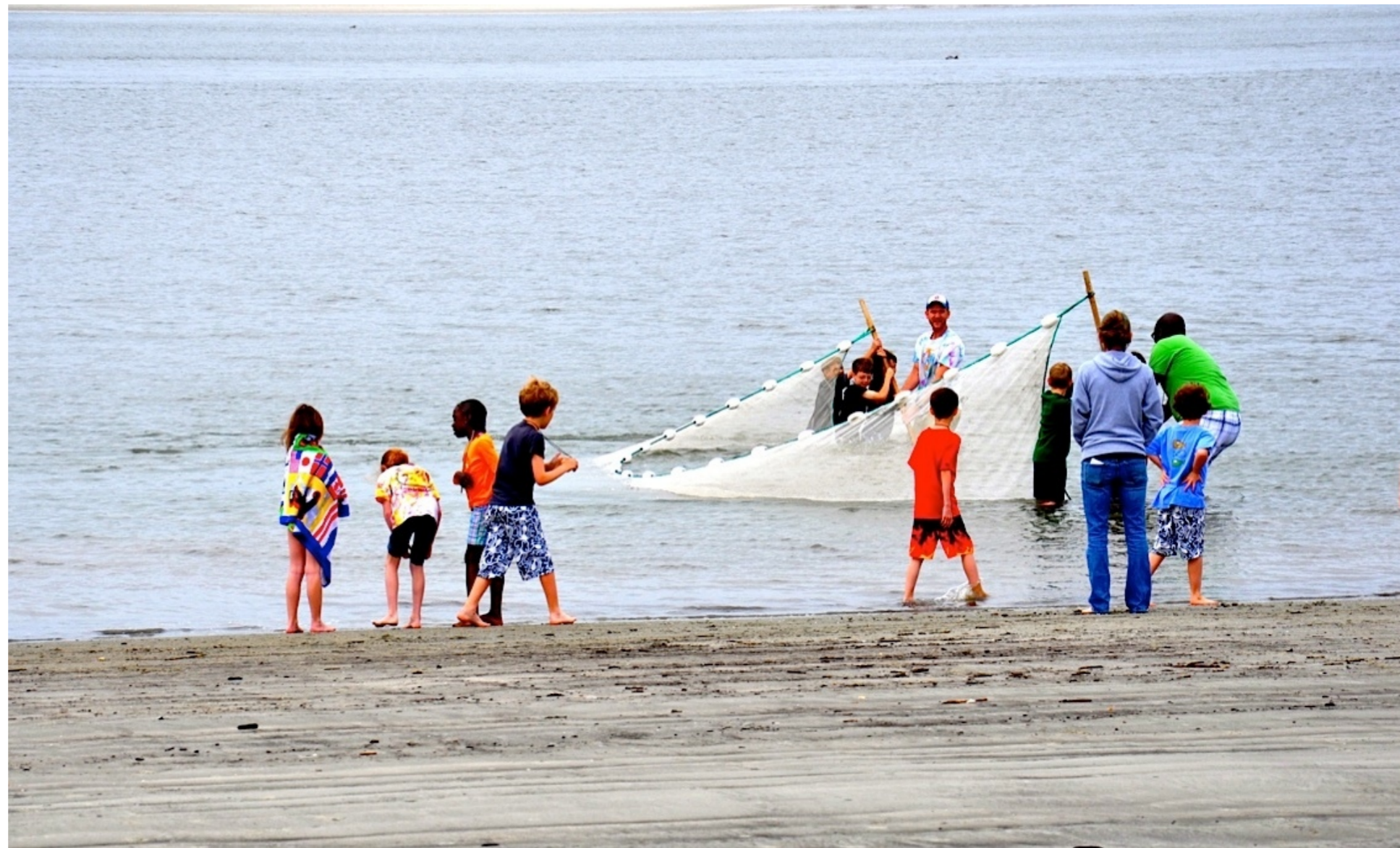
Second Graders seining in the ocean during their Capstone Field Experience on Seabrook Island.

Traveling is often a transformative experience, offering students the opportunity to demonstrate personal responsibility and growth, while creating lifetime memories. Riverview believes learning should be transformative and memorable as well, and by providing Capstone Field opportunities to all of our 2nd, 5th, and 8th grade students, Riverview hopes to inspire its students to “Connect the Dots” and better understand their place and contribution to the world.