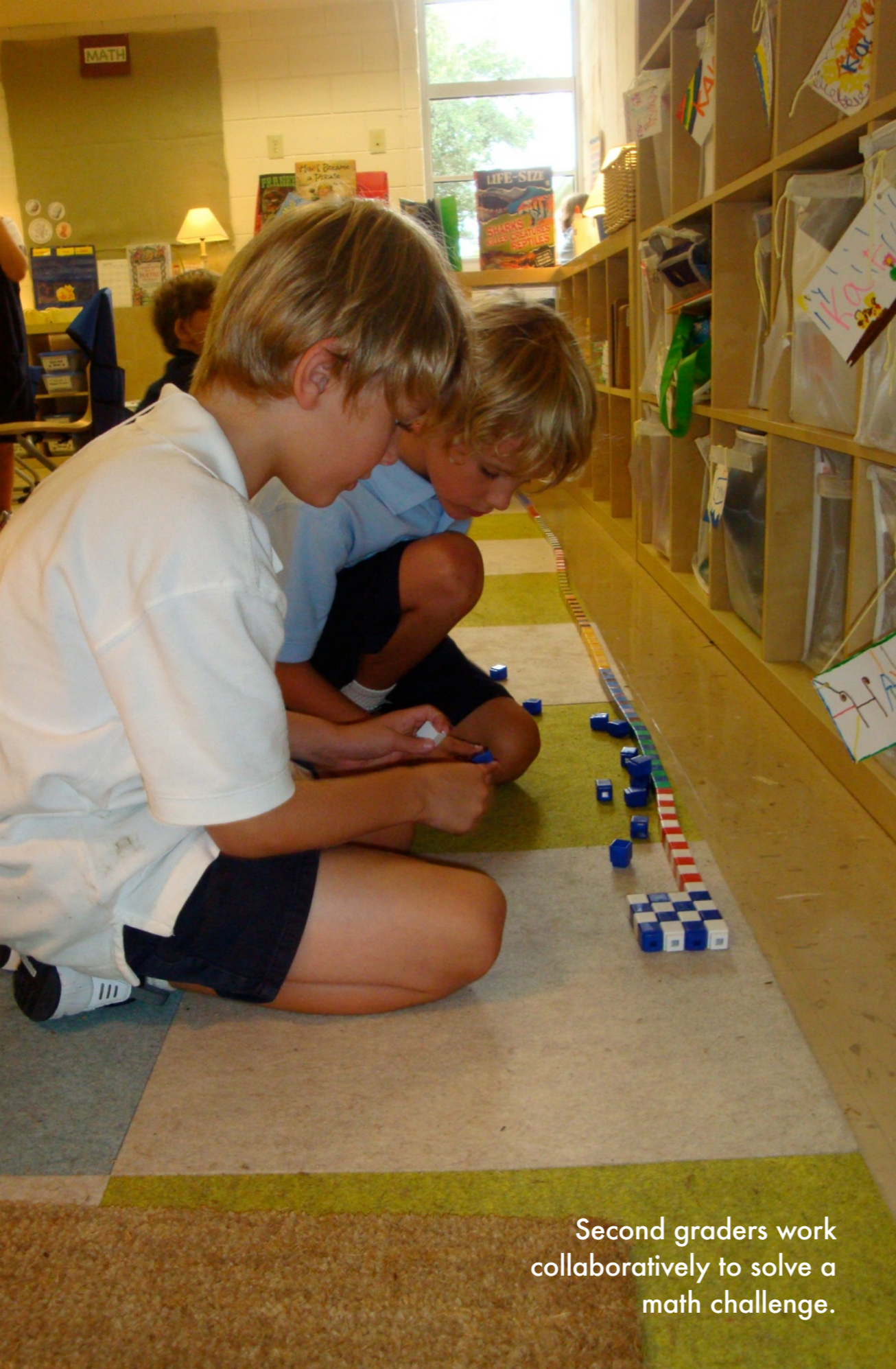
Second graders work collaboratively to solve a math challenge.