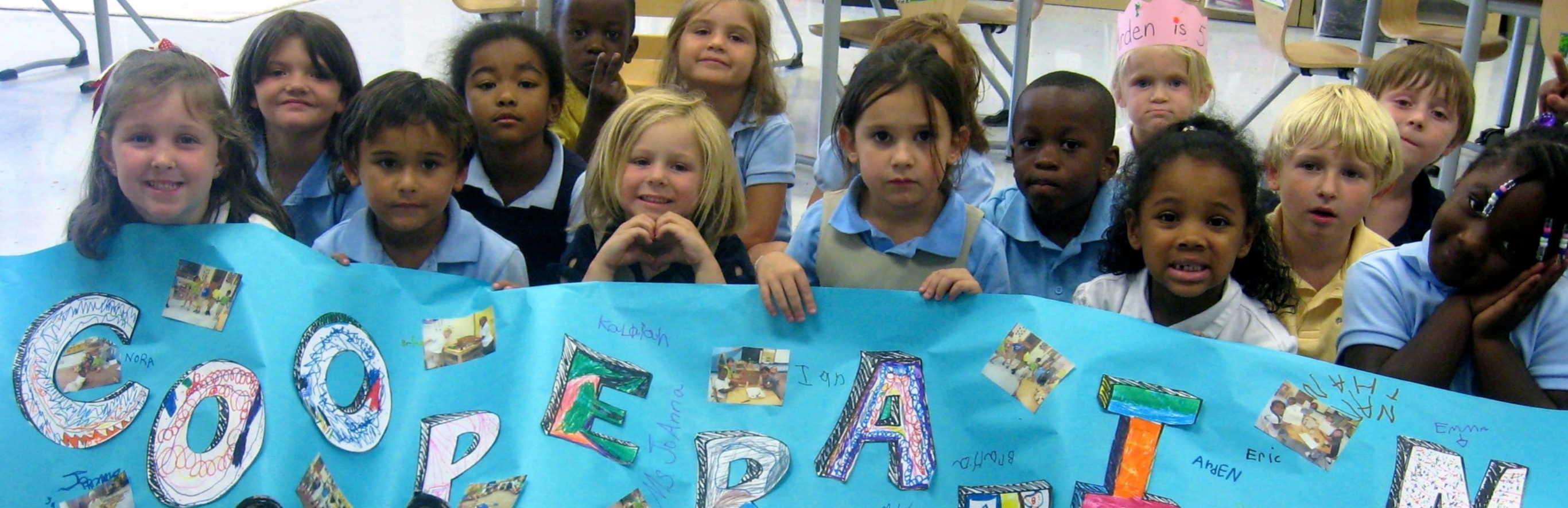
Kindergarteners learn about one of Riverview's Core Values: Cooperation