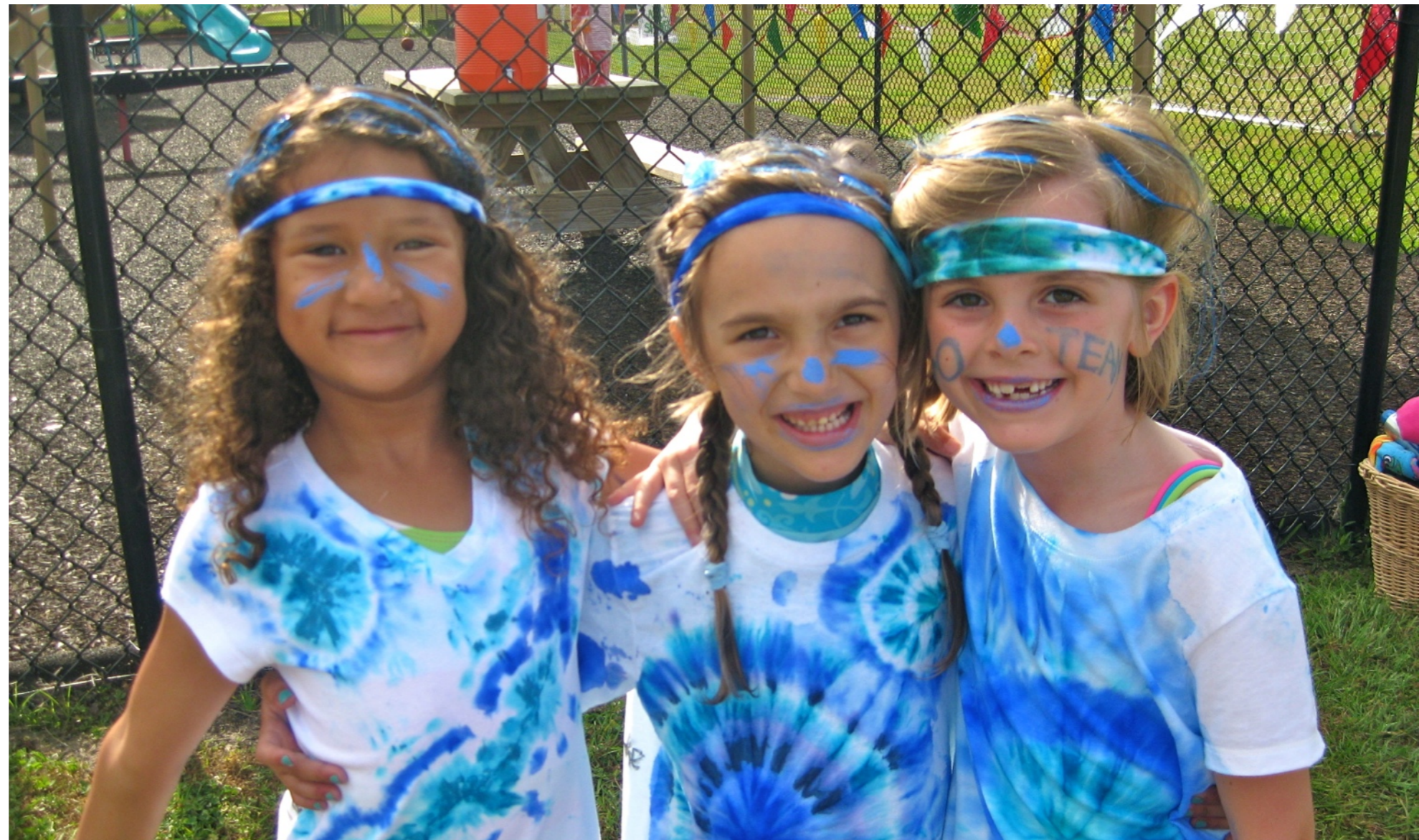
Kindergarteners show their team spirit on Field Day.

Using experiential principles as our guide, Riverview employs a variety of research-based educational approaches to help students master 21 st century skills and the South Carolina Academic Standards through meaningful learning experiences.