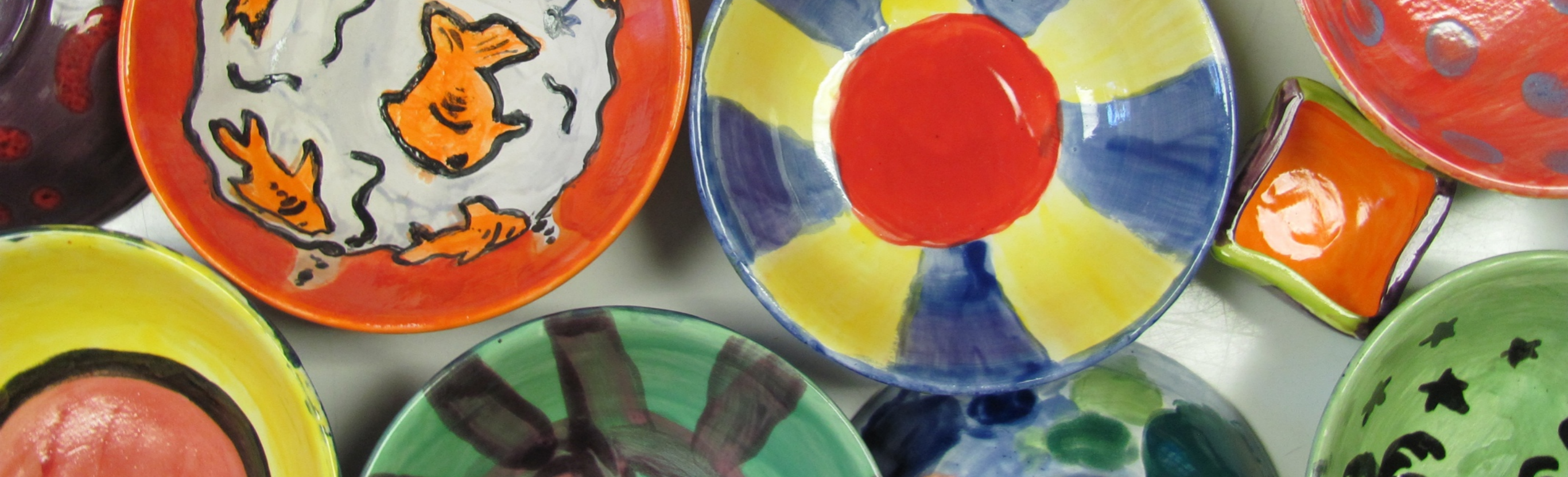
Bowls made by students as a part of the school's annual Empty Bowls Service-Learning project.